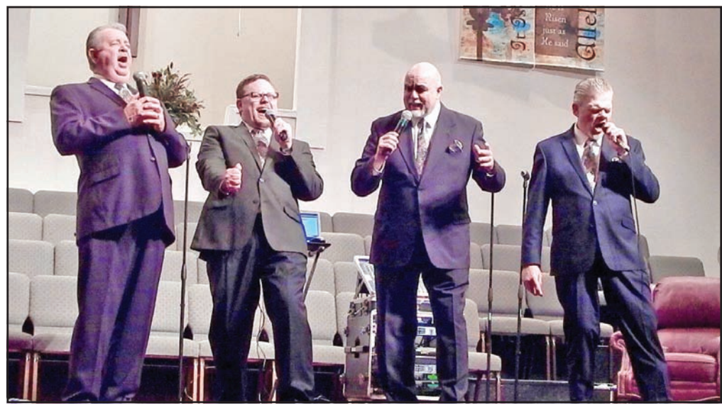
The Jordan's Bridge quartet will be performing at the Third Annual North Georgia Sing on Saturday, May 5, at 6 p.m. inside McConnell Memorial Baptist Church in Hiawassee.